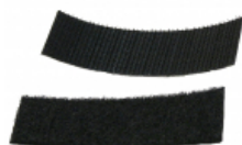
Hook & Loop Mounting Strip 1592ETV